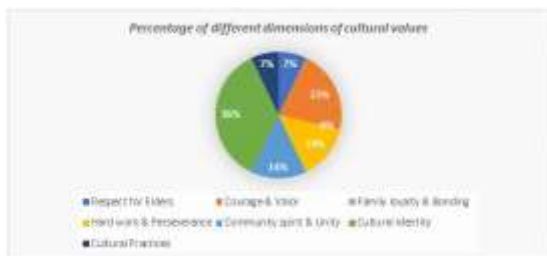
Diagram:1 Percentage of different dimensions of cultural values

Respect for elders has the highest mean (4.27), indicating that most respondents highly agree with this value, showing that respect for elders is a critical cultural value in Rajasthani folk songs. The relatively low standard deviation (0.72) indicates that responses are fairly consistent across households. This cultural value has a moderately high mean (3.93), showing it is regarded as important, but the standard deviation (0.98) suggests some variability in responses. The percentage (22%) indicates that a significant portion of respondents see courage and valor as influential, likely linked to regional narratives and history in Rajasthani culture (Jha & Sharma, 2020). Family loyalty has a high mean (4.09), indicating strong agreement among respondents that this is a vital cultural value. The low percentage (0%) may indicate that no respondents found it a primary influencer compared to other factors, despite high consensus. This value also scores highly (4.14), reflecting the significance of hard work in rural communities. The percentage (14%) suggests that a notable proportion of respondents view Hard work & perseverance as a key trait influenced by cultural traditions. Community spirit and unity have a moderately high mean (3.87) but with the highest standard deviation (1.00) among the values, reflecting a wide range of opinions. The percentage (14%) shows that it is a significant value but not universally agreed upon. Cultural Identity has the lowest mean (3.64) but