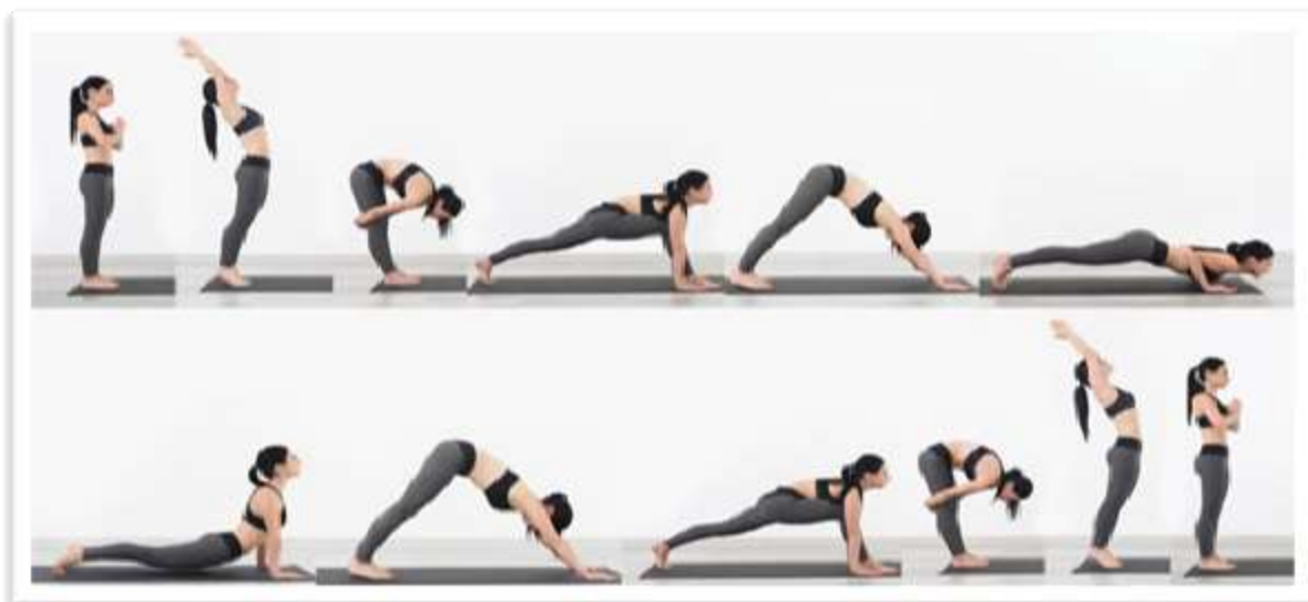
Surya Namaskar Yoga